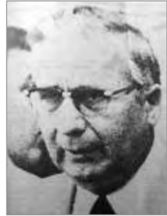
Licio Gelli, former grandmaster of P2 (Propaganda Due), an illegal right-wing Masonic lodge with links to Nazism. The members of P2 included the current Prime Minister of Italy, Silvio Berlusconi.

Historically, P2 is well known to have had links to Nazism and extreme right-wing groups. Licio Gelli, its former grandmaster, was jailed in 1998 for corruption and fraud in connection with the Banco Ambrosiano scandal and has been openly described by the New York Times as "a known Fascist." The investigative writer David A. Yallop, in his book 'In God's Name: An Investigation into the Murder of Pope John Paul I', even alleges that Gelli was involved in a conspiracy that led to the murder of Pope John Paul I, who reigned for only 33 days, in 1978. Even more disturbingly, some sources, including the New Zealand Herald and The Observer newspaper in the UK, allege links between P2 and state terrorism. Others meanwhile, such as the BBC, state it had connections with both the Mafia and right-wing terrorist groups.