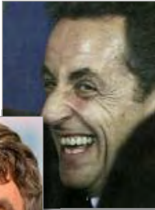
British Prime Minister Gordon Brown and French President Nicolas

Sarkozy rang José Sócrates, the Portuguese Prime Minister, to insist that a referendum on the Lisbon Treaty was not necessary.