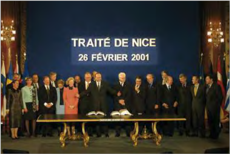
The signing of the Nice Treaty, 26 February, 2001.