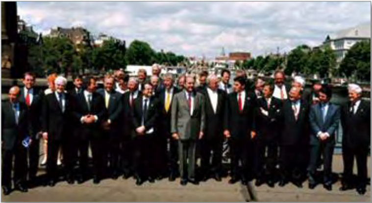
European leaders assembled for the signing of the Amsterdam Treaty, 2 October, 1997.