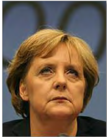
German Chancellor Angela Merkel was instrumental in resurrecting the rejected European Constitution and renaming it as the Lisbon Treaty.

To the shock of the French and Dutch, however – and, also, countless millions of democratic people throughout Europe – 96 per cent of its articles turned out to have been copied from the rejected EU Constitution. As shock turned to anger, even Valéry Giscard d'Estaing, the text's principal draftsman, was eventually forced to admit that differences between the treaty and the constitution "are few and far between and more cosmetic than real".