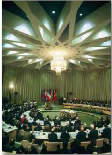
The signing of the Maastricht Treaty, 7 February, 1992.