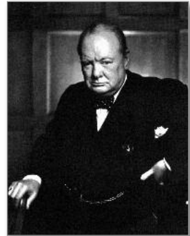
Sir Winston Churchill, Prime Minister of the United Kingdom 1940-1945, 1951-1955.

Although fighting only one fleet action during WWI, at Jutland on 31 May, 1916, the British navy was successful in preventing Germany's navy from escaping the confines of the North Sea. In so doing, it played a decisive role in enabling maritime trade between Britain and its allies to continue throughout the war. Along with the mass army it provided, Britain was also the arsenal and financier of the alliance and decisively withstood even Germany's declaring of unrestricted submarine warfare in February 1917 1 . As such, without Britain's efforts it is clear that the outcome of WWI would have been very different.