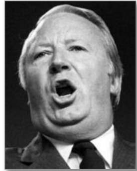
Edward Heath, British Prime Minister between 1970 and 1974, was well-connected with the elite of the Cartel and delivered Britain into the hands of the Brussels EU in 1973.

Heath was well-connected with the elite of the Cartel, attending a meeting of the clandestine Bilderberg Group in 1976 6 and addressing a meeting of the Rockefeller-led Trilateral Commission in 1980 7 . Holding the post of British prime minister between 1970 and 1974, he was also a friend of the Glaxo drug company Chairman and Chief Executive Sir Austin Bide – the man described by Britain’s Independent newspaper as being “principally responsible for the transformation of Glaxo from a company best known for its baby foods into a world force in the pharmaceutical industry.” 8 Significantly, it is notable that Bide, while seconded to Glaxo during WWII, had worked on vitamins and penicillin and was also responsible for patents. 9