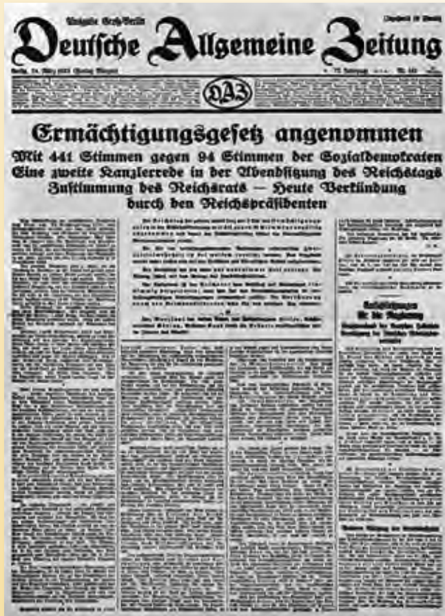
Front page of the Deutsche Allgemeine Zeitung newspaper, March 24, 1933, announcing that Hitler’s Enabling Act had been adopted.

The historic parallel to the seizure of power by the Oil and Drug Cartel by means of the Brussels EU is the takeover of the German government by the same interest groups three-quarters of a century ago.