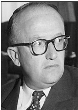
Walter Hallstein: German lawyer, Chief Architect and First President of the 'Brussels EU' from 1958 to 1967