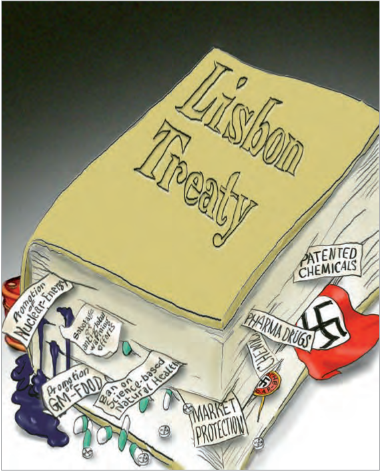
The 'Lisbon Enabling Act' – Platform for the Oil and Drug Cartel's attempt at the Takeover of Europe